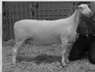
2013 Champion White Dorper Ewe