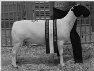
2013 Champion Dorper Ewe