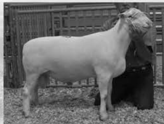
2013 Champion White Dorper Ram