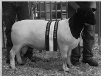
2013 Champion Dorper Ram

Non-Seasonal Breeding • Excellent Maternal Traits • Newborn Lamb Vigor