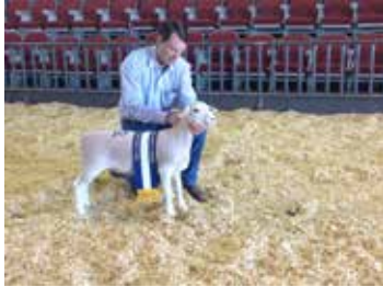
1 st White Dorper January Ewe Lamb at the 2013 Mid-America Dorper Sale