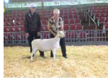
1 st White Dorper Yearling Ewe at the 2013 Mid-America Sale.

This Spring yearling QR ram is very correct on his feet and legs, a complete shedder with muscle from front to rear. Carries Australian bloodlines. Check our website for pictures of all of our sale entries in their working clothes.