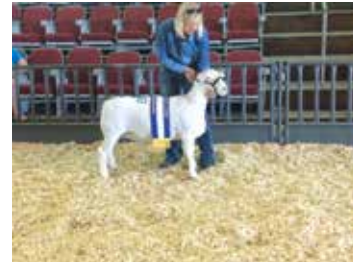
1 st White Dorper Yearling Ewe at 2013 Mid-America Dorper Sale.

QR Fullblood. Dermatoparaxis free. 5988 was 2 nd Winter Ram Lamb at NAILE. 5487 is a Kaya "36" son. 5788 is a heavy muscled moderate sized ram. Bone Crusher was 2-time Champion Ram at NAILE and was Supreme over all breeds at 2013 Kentucky State Fair.