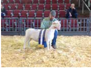
Champion White Dorper Early Fall Ewe Lamb at the 2013 Mid-America Dorper Sale.