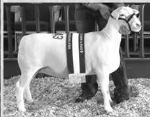
1st White Dorper Yearling Ewe 2013

Early Maturity • Increased Fertility • Non-Seasonal Breeding Excellent Maternal Traits • Newborn Lamb Vigor