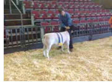
Reserve Champion Dorper Yearling Ram at the 2013 Mid-America Dorper Sale, sold from Texas to Michigan.