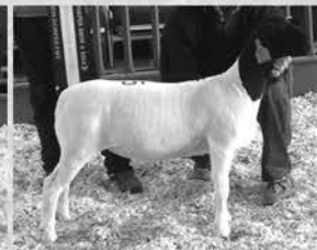
Champion Dorper January Ewe Lamb 2013