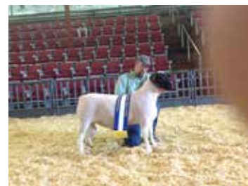
Champion Dorper Yearling Ram at the 2013 Mid-America Dorper Sale, sold from Ohio to Texas.

ADSBS will be conducting a SILENT AUCTION on Saturday to benefit the new AMERICAN DORPER YOUTH SHEEP BREEDERS SOCIETY. Please bring items to donate to this effort