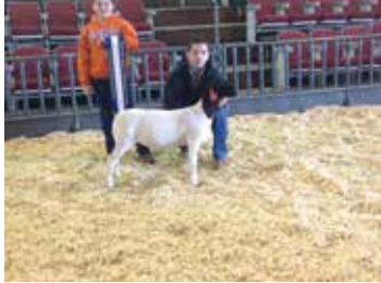
Champion Dorper Spring Ewe Lamb at the 2013 Mid-America Sale, sold from Missouri to Kansas.