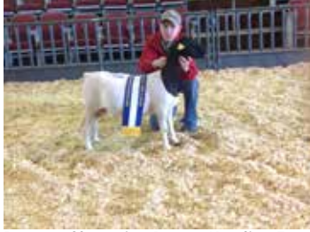
Reserve Champion Dorper Yearling Ewe at the 2013 Mid-America Dorper Sale.