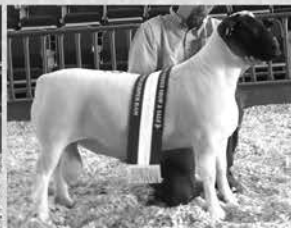
Champion Dorper Yearling Ram 2013