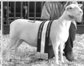
Champion White Dorper Fall Ewe Lamb 2013