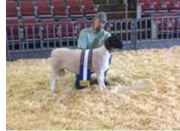
1 st Dorper Fall Ram Lamb at the 2013 Mid-America Sale.